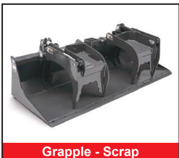
Grapple - Scrap

Takeuchi now offers attachments for all of your Takeuchi equipment. See your authorized Takeuchi dealer for additional information and attachment options.