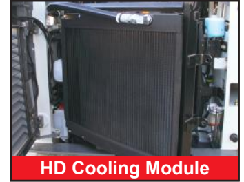
HD Cooling Module

The TL12R2 features a radial lift loader arrangement, and demonstrates Takeuchi's continued commitment to product improvement and innovation. It features a completely redesigned operator's station with a 5.7" color multi-information display excellent feature set, and updated rocker switches that control a wide range of machine functions. Cab models have a smooth, low effort overhead door that improves entry and egress and enables the loader to be operated with the door in the raised or lowered position. An updated undercarriage with a wide block quiet ride track system provides better flotation, improved ride quality, and a reduction in noise and vibration.