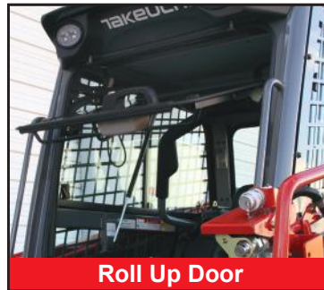
Roll Up Door