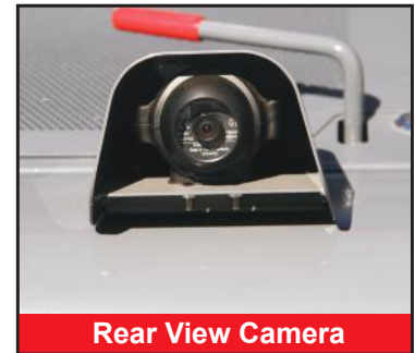
Rear View Camera