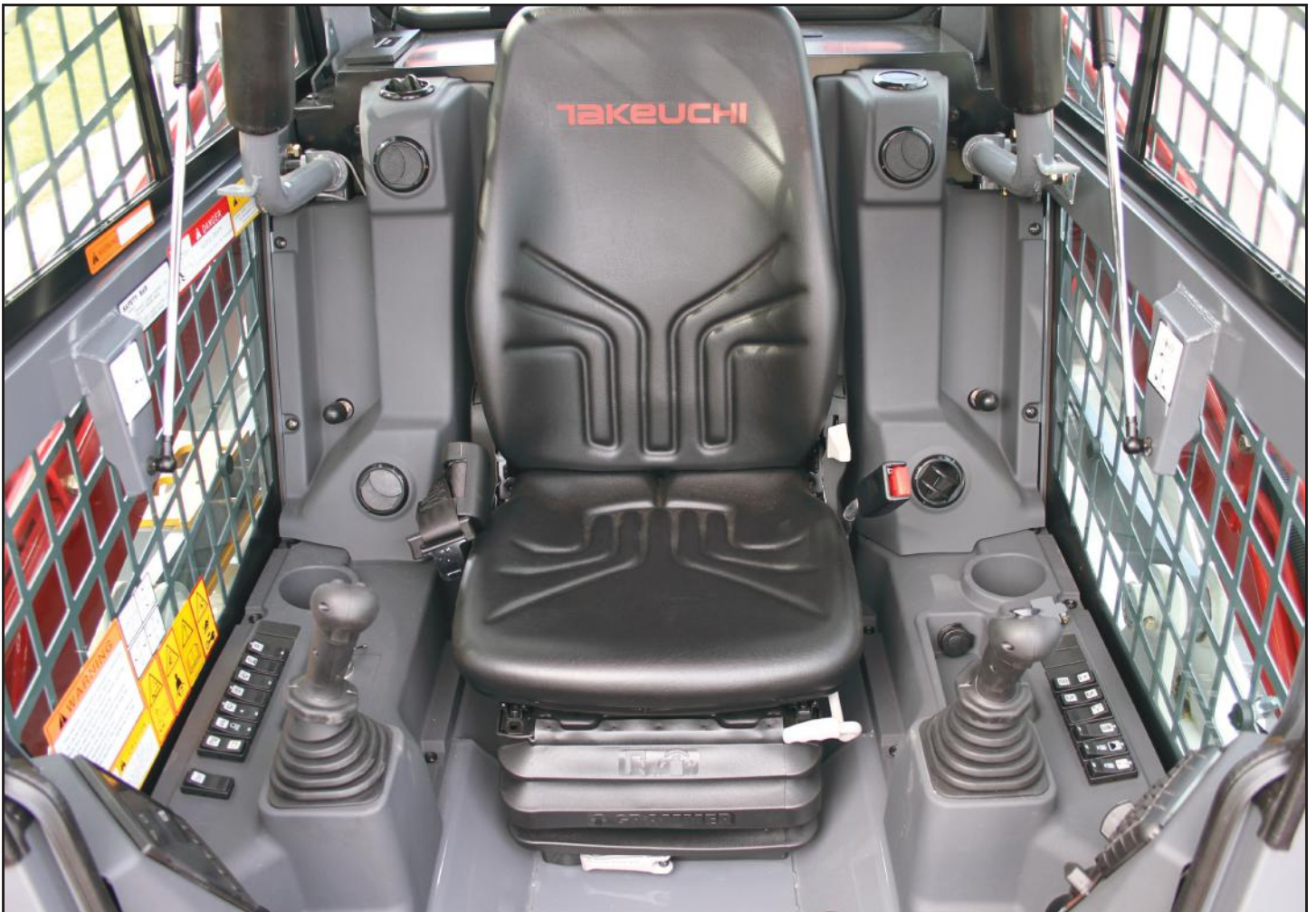
Spacious operator's platform with easy to reach controls and switches.

Equipped with the Takeuchi Fleet Management (TFM) telematics system critical information such as machine health, condition, diagnostics, and location can be viewed remotely providing valuable real time machine information that will help control costs and keep downtime to a minimum. The Takeuchi Fleet Management system is a real value as the service is free for the first two years of machine ownership.