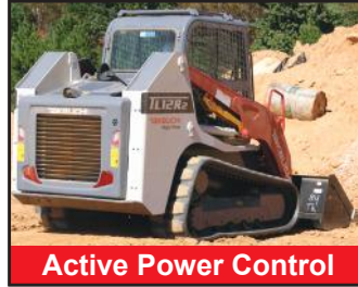
Active Power Control