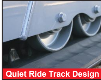
Quiet Ride Track Design