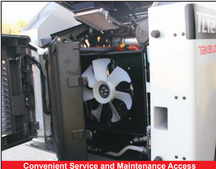
Convenient Service and Maintenance Access